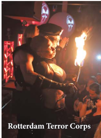
Rotterdam Terror Corps

TR-99 spared no expense on this party and it showed. The main stage felt otherworldly. A giant LED screen featured the DJs’ names in intricate designs. Orbs surrounding the stage received mind-blowing projections; they looked like planets or other parts of outer-space. The old school room had Pac-Man themed visuals in a black-light style, and attendees could play retro arcade games that were projected on a giant screen.