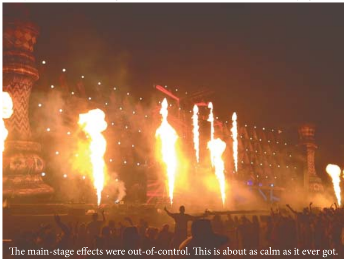
The main-stage effects were out-of-control. This is about as calm as it ever got.