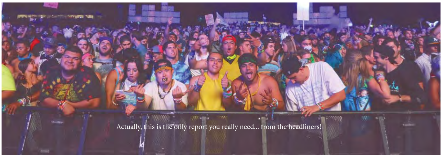
Actually, this is the only report you really need... from the headliners!