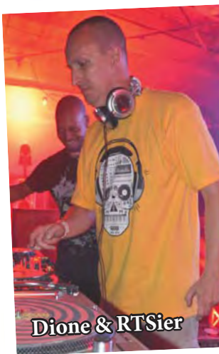
Dione & RTSier